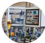
Power Timers, Solenoids and Controllers