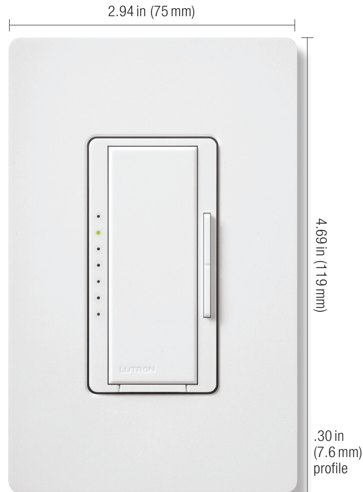
Shown actual size: Maestro dimmer and 1-gang Claro wallplate in White (WH).