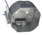
54171 NL L bracket mounted flush