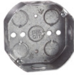
54151 1/2 & 3/4