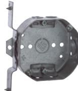
54151 NV V bracket recessed 1/2"