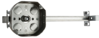
54151 J 1/2 Mounted on 6010-DW bar adjustable 10 1/2" to 18 1/2". Offset for 1/2", 3/4" or 7/8" plaster. Maximum horizontal positioning. 3/8" fixture stud.