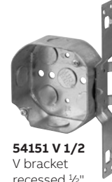
54151 V 1/2 V bracket recessed 1/2"