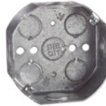
54171 1/2 3/4