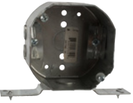
54171NV-25 V bracket recessed 1/2"