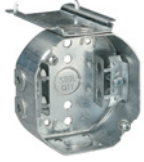
54151 AL L bracket mounted flush