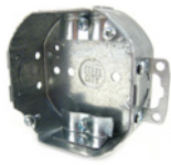
54151 NE Adjustable ears recessed 5/8"