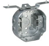
54151AV-25 V bracket recessed 1/2"