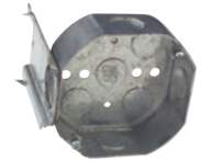
54151 L 1/2 L bracket mounted flush