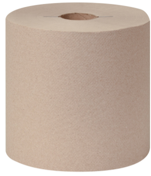
UNIV HARDROLL TWL 1-PLY NATR 6 /800 7171300