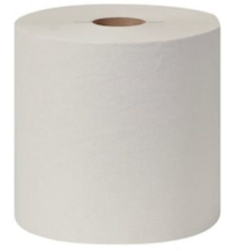
UNIV HARDROLL TWL 1-PLY WHT 6 /630 7171600