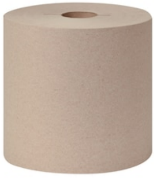
UNIV HARDROLL TWL 1-PLY NAT 6 /1000 7171020