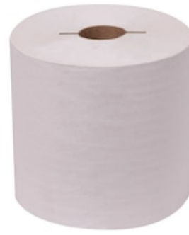
UNIV HARDROLL TWL 1P NAT/WHT 6 /800 7171400