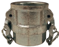
plated malleable iron