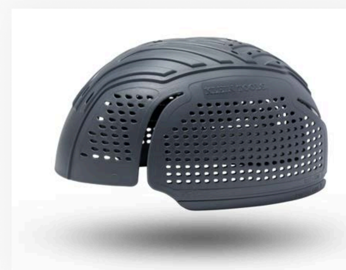
22018 Bump Cap Insert