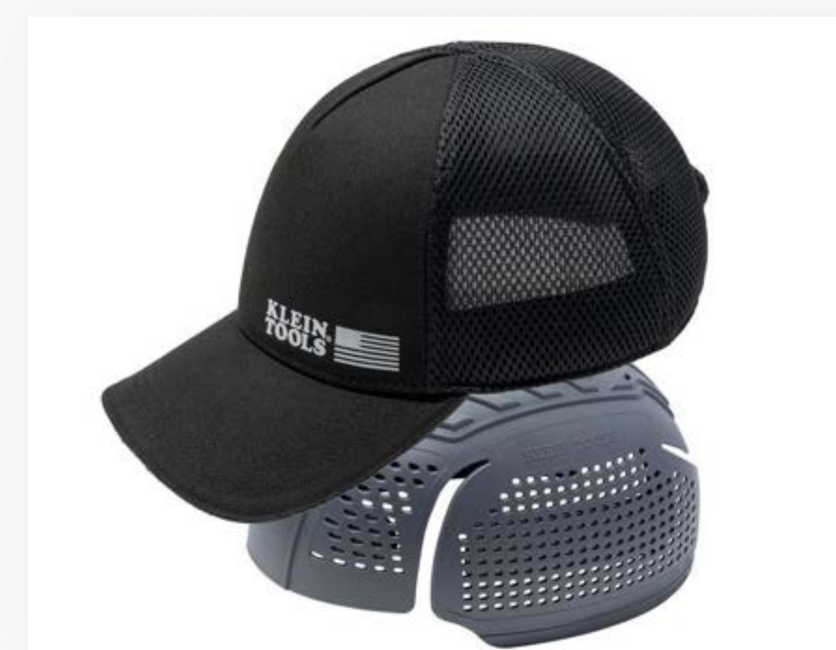
22017 Adjustable Bump Cap