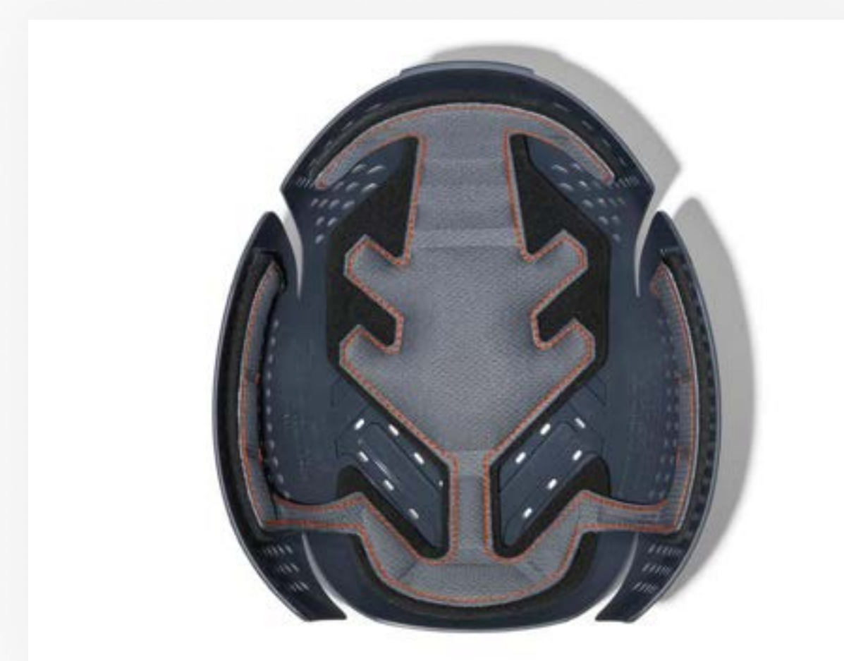
22013 Bump Cap Insert Top Pad