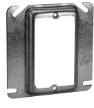
TP482, TP484, TP486, TP489