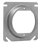
TP473, TP475, TP476, TP477, TP479, TP483