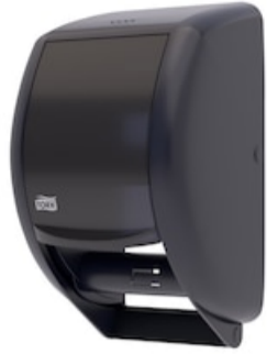
DISP T24 CBT 2-ROLL SMOKE 1/CS 55TR