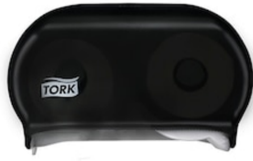
DISP T24 2RL HORIZ CBT SMOKE 1/CS 59TR