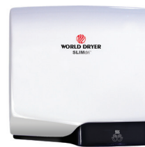
Aluminum , White