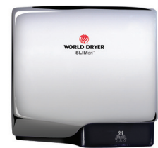
Aluminum , Polished Chrome