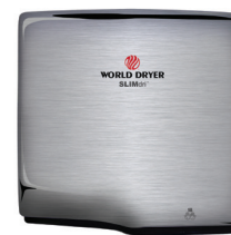
Stainless Steel , Brushed