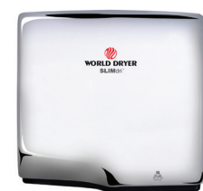
Stainless Steel , Polished