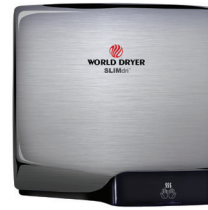
Aluminum , Brushed Chrome