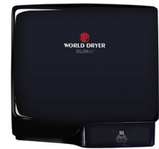
Aluminum , Black