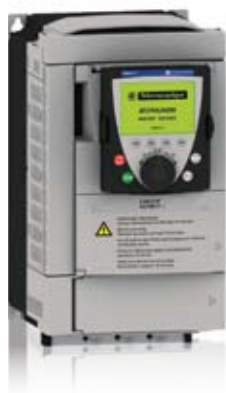
Altivar 71 drive