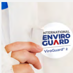
Zipper front with sealable storm flap - has starter tab for tape Easier for a gloved hand to pull & expose the tape for sealing storm flap.