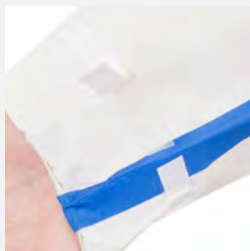
Double-sided tape around the wrists Helps keep gloves in place.