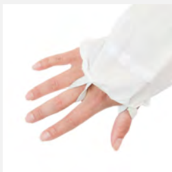
Thumb & Finger Loops Prevents sleeves from riding up