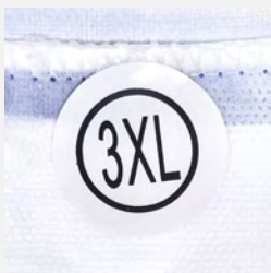
Visible sizing tag Helps materials management teams identify size easily when suits are removed from the box.