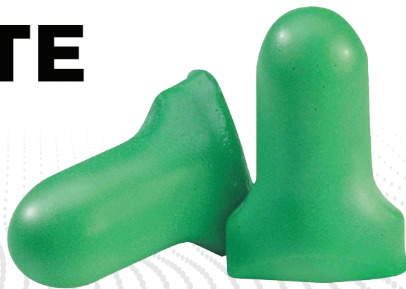
LPF-1 / NRR 30 (shown)

Honeywell MAXIMUM LITE earplugs are designed to ensure minimum pressure and maximum comfort in a disposable earplug.