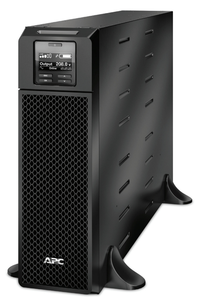
SRT5KXLT shown ]