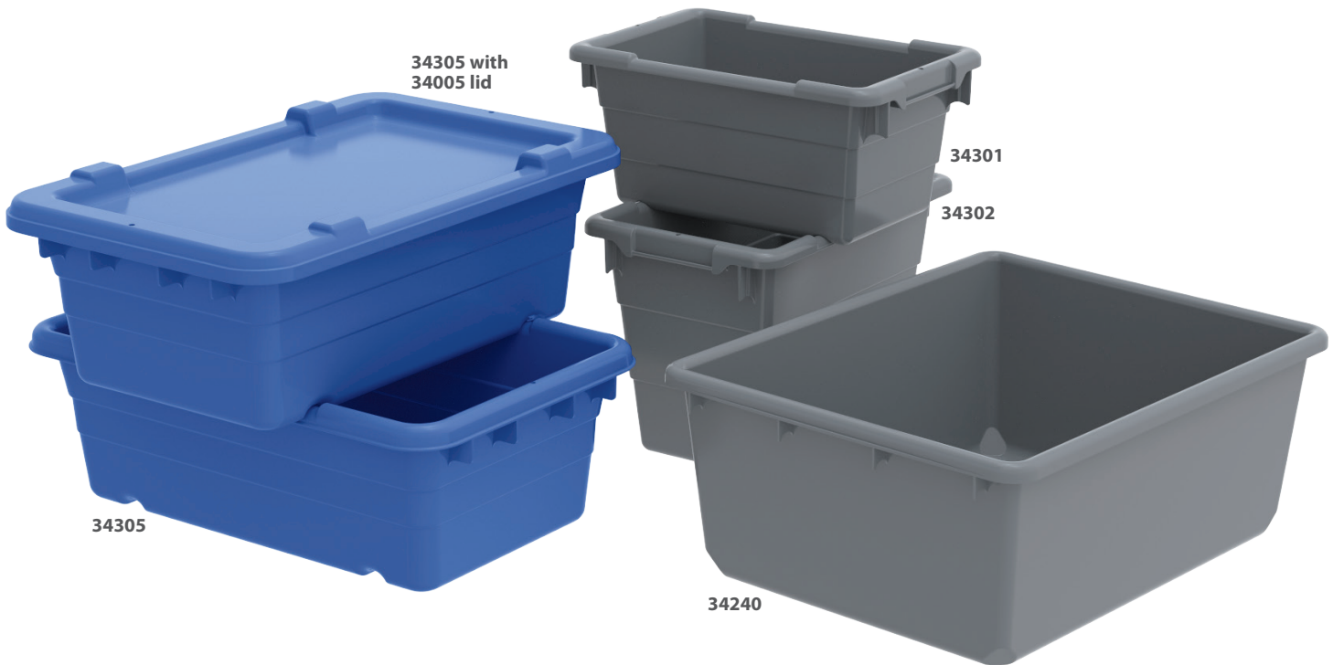
34305 with 34005 lid