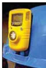
Hard Hat Clip GA-HC-1