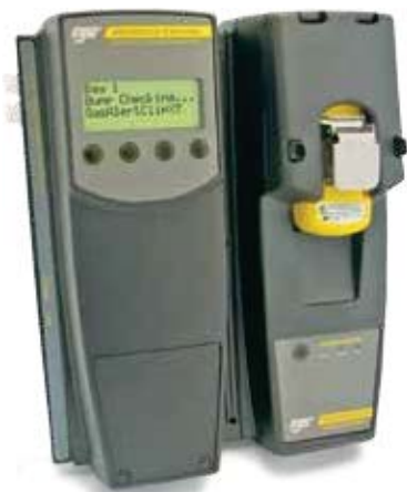
MicroDock II Automatic test and calibration station (see MicroDock II section for additional information)

Calibration & Testing Equipment For calibration and testing equipment for this product, please see pages 82-85.