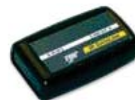
IR DataLink GA-USB2 USB adaptor