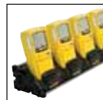
Multi-unit cradle charger