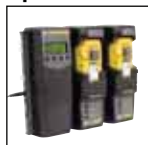
MicroDock II compatible