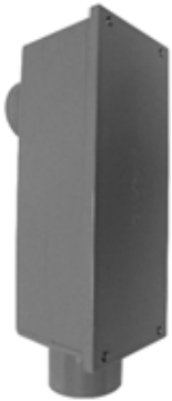
2-1/2" THROUGH 4"