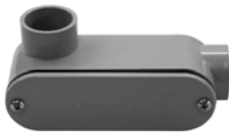
1/2" THROUGH 2"