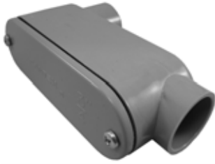
1/2" THROUGH 2"