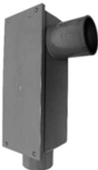
2-1/2" THROUGH 4"