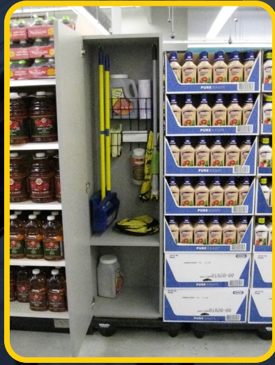
Inline Isle Cabinets