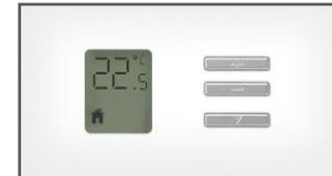
Built-in Electronic Thermostat