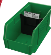
30230 with 41231 Divider and 40000 Divider Label Tab