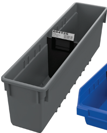
30420 with 40420 Divider and 40000 Divider Label Tab