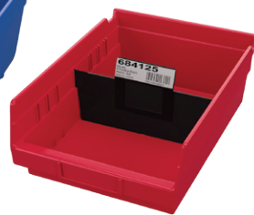
30150 with 40150 Divider and 40000 Divider Label Tab