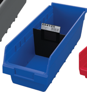
30098 with 40030 Divider and 40000 Divider Label Tab