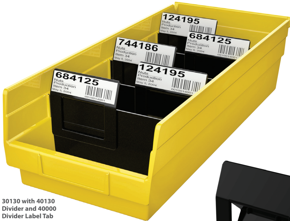
30130 with 40130 Divider and 40000 Divider Label Tab