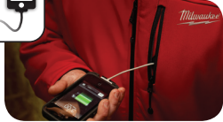
In-Pocket USB Port