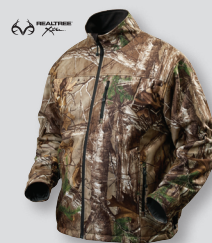
Realtree Xtra® Camouflage