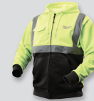
High Visibility Heated Hoodie Kit