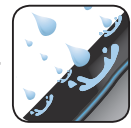
Water and Wind Resistant