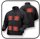
Distributes Heat to Core Body Areas and Pockets