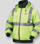
High Visibility Heated Jacket Kit