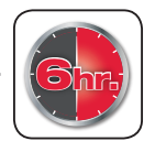
Up to 6 Hours of Continuous Heat