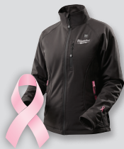
Special Edition Women's Heated Jacket Kit