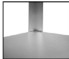
Flat Top Shelves