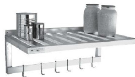
T-Bar Wall Shelf / Pot Rack