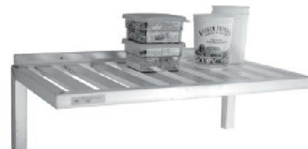
T-Bar Wall Shelf