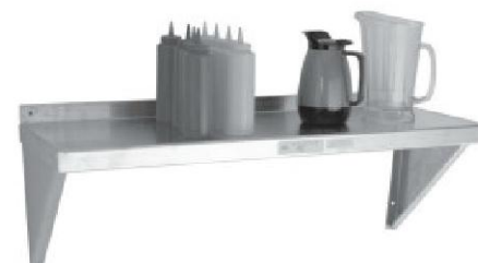
Solid Wall Shelf • H.D. & Standard