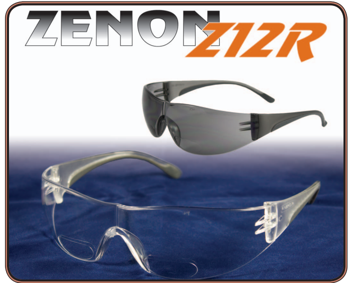
Polycarbonate lenses block 99.9% of the sun's ultraviolet rays. This ultraviolet protection has already been incorporated within the lens material when the lenses are being produced.

Country of Origin/Harmonization Code: Taiwan/9004.90.0000