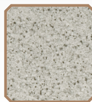
Cape Cod Gray