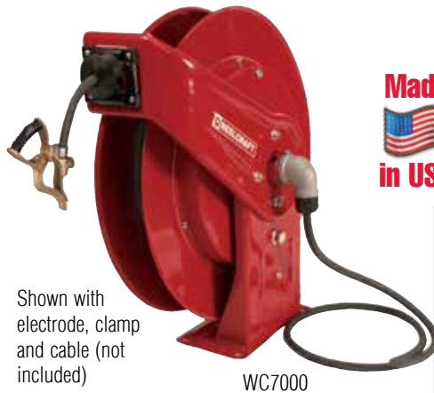
Shown with electrode, clamp and cable (not included)