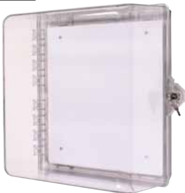
STI-7530 with Key Lock