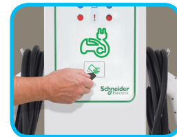
Authentication with Radio Frequency Identification (RFID) cards