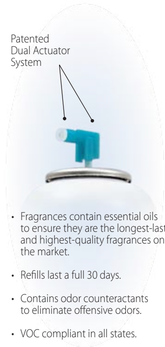
Patented Dual Actuator System

TimeMist invented metered air technologies and continues to provide the best fragrances on the market. Our name serves as a benchmark in our industry and is a reason why so many other premium fragrance brands select our company as the provider of choice for their product lines.