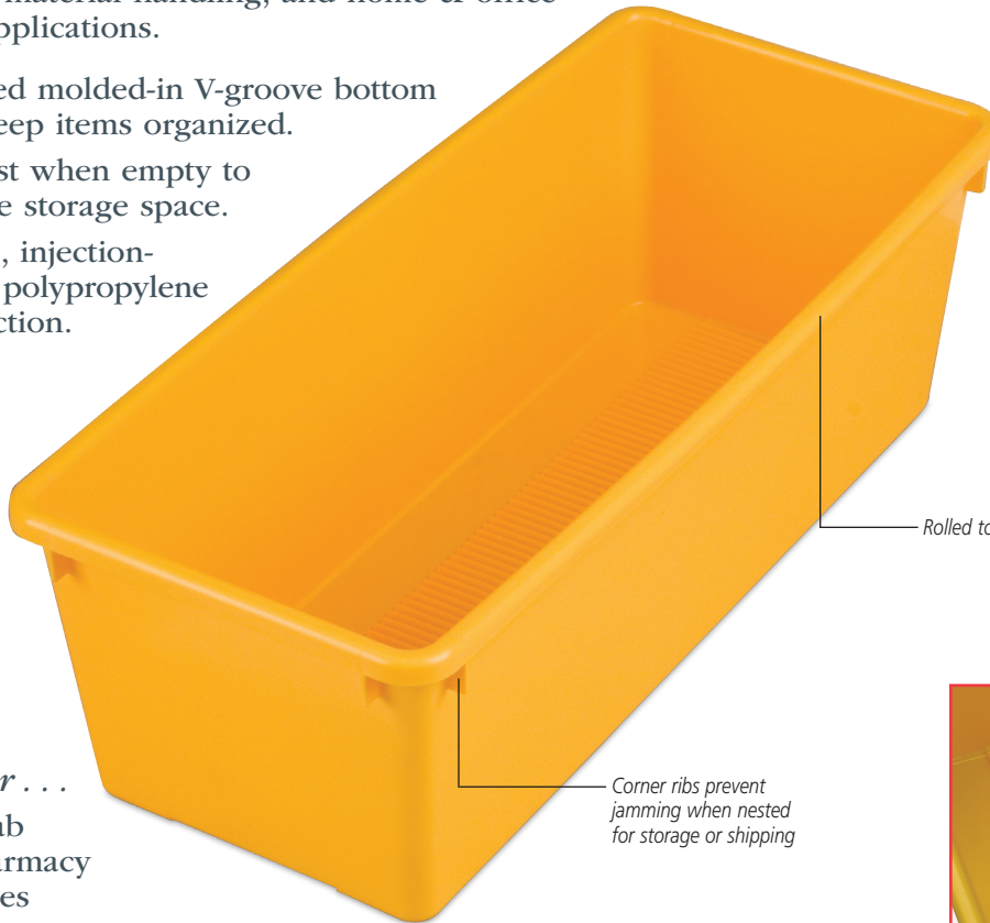
— Rolled top rim for added strength and durability