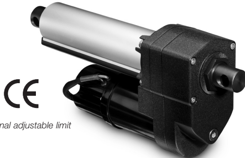
Shown with optional adjustable limit switch feature

The K2 is the base model in the B-Track family. It incorporates a patented in-line load transfer design which provides high load capability for rugged-duty use, efficient power use, compact package size, excellent corrosion and washdown protection, and high performance synthetic lubrication for life, all at an affordable price.