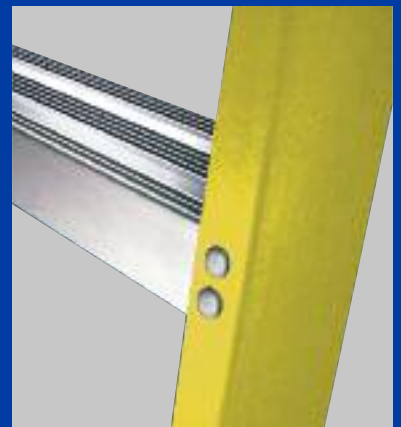
Slip-resistant Traction-Tred® steps