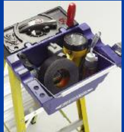
HolsterTop® with the new Lock-in Accessory System