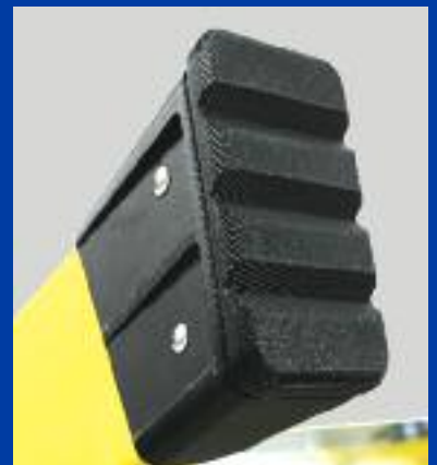
New oversized, molded PROGUARD BOOTS™