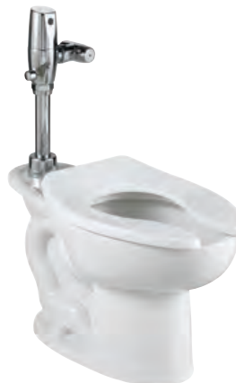
Madera™ Floor Mount Toilet Grainger #12KZ3 Selectronic Flush Valve Grainger #16T987