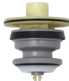
Toilet Flush Valve Assembly Grainger #33KL04