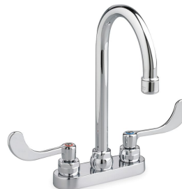
Monterrey® Gooseneck Commercial Faucet Grainger #41H849