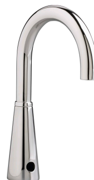
Selectronic® Faucets Grainger #29RT64