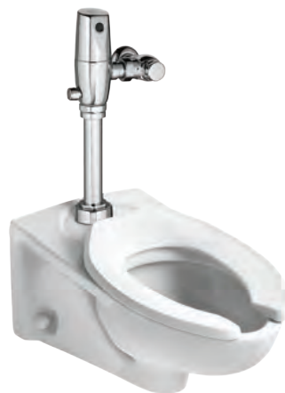
Afwall Millennium Toilet Grainger #20HK93 Selectronic® Flush Valve Grainger #31AA30