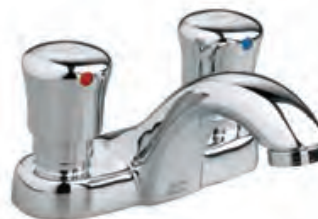
Metering Faucets Grainger #1FYB7

Our commitment to current and future users of American Standard products is best demonstrated by our comprehensive offering of repair parts available through Grainger. Users can access over 500 repair parts on Grainger.com®