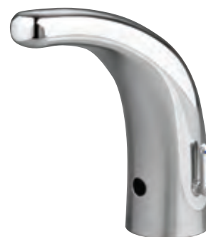
Selectronic® Faucets Grainger #16U064

* All lavatory faucets with 1.5 GPM maximum flow rate will be converted to 1.2 GPM maximum flow rate by October 2015. † In compliance with Federal and State law.