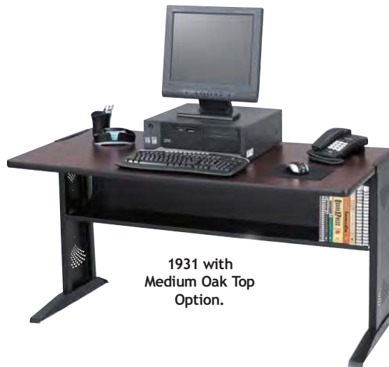
1931 with Medium Oak Top Option.