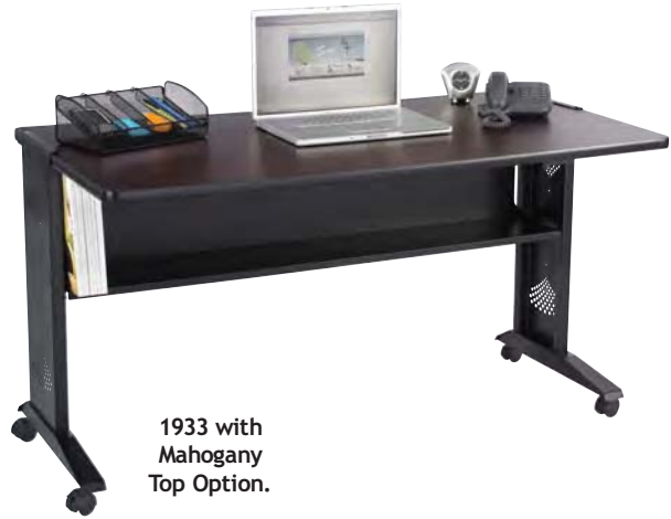
1933 with Mahogany Top Option.