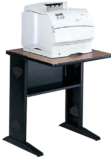
1934 with Mahogany Top Option.