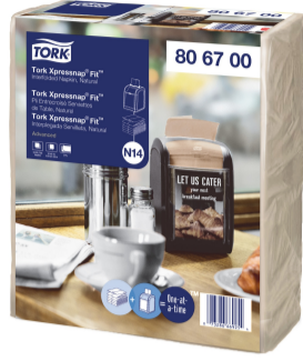
ADV XPRESSNAP FIT NAP NAT 120/6/6 806700