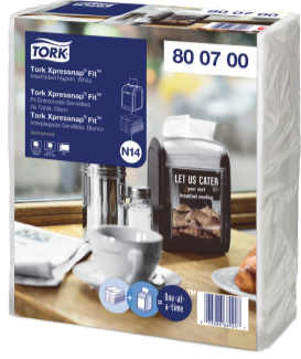
ADV XPRESSNAP FIT NAP WHT 120/6/6 800700