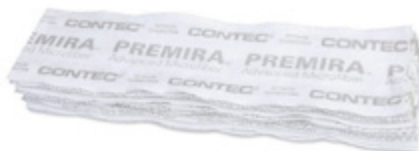
Disposable Microfiber Pads