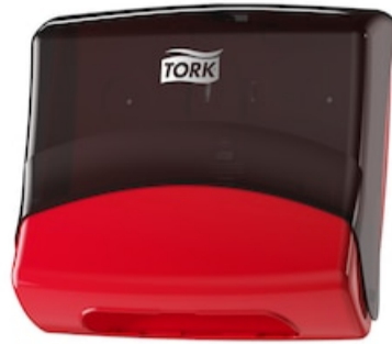
DISP W4 PERFOR TOPHOLD RED/BLK 1/CS 6540281