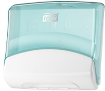
DISP W4 PERFOR TOPHOLD WHT/BLU 1/CS 654021