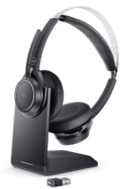
Premier Wireless ANC Headset - WL7022

Elevate your video conferencing experience with the world's best image quality 4K webcam 26 that optimizes your visuals with a large 4K Sony STARVIS™ CMOS sensor and AI Auto-Framing.