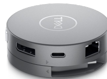
Dell 7-in-1 USB-C Multiport Adapter - DA310

Get uninterrupted productivity with a rechargeable mouse that offers up to six months battery life on a full charge. Connect up to three devices and recharge in just two minutes for a full day's work.