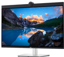
Dell UltraSharp 32 4K Video Conferencing Monitor - U3223QZ

Featuring Dell's most intelligent webcam in a 31.5" 4K video conferencing monitor, this is the first monitor in its class with IPS Black panel technology 21 .