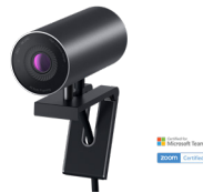
Ultrasharp Webcam - WB7022

Modular thunderbolt dock with swappable modules for easy upgrades and SuperBoost technologies for fast charging.