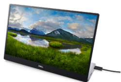
Dell 14 Portable Monitor - C1422H

Experience dual-screen productivity anywhere with Dell's first-ever 14" portable monitor.