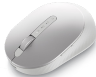
Dell Premier Rechargeable Wireless Mouse - MS7421W

Experience dual-screen productivity anywhere with Dell's first-ever 14" portable monitor.