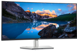
UltraSharp 40 Curved WUHD Monitor - U4021QW

Redefine productivity on this revolutionary 40" curved WUHD 5K2K monitor that delivers exceptional color and clarity.