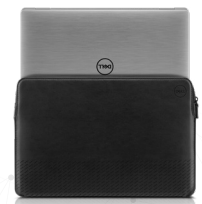
Dell EcoLoop Leather Sleeve 14

A compact multiport 6-in-1 adapter that offers video, network, data connectivity and up to 90W power pass-through for your laptop.