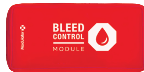
PRO BLEED CONTROL MODULE Code: M6009 Case Included