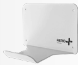
Item: Metal Wall Bracket Code: MWB01

This sturdy metal wall bracket keeps your response kit visible and ready for emergencies.