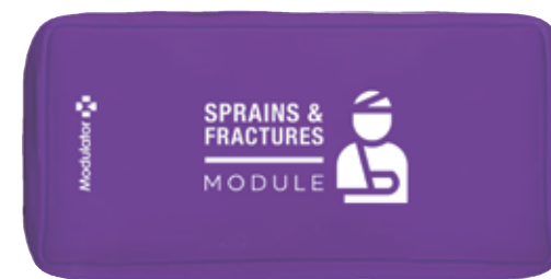
SPRAINS & FRACTURES MODULE Code: M6007 Case Included