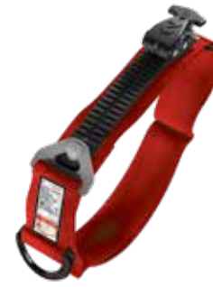
Item: RapidStop® Tourniquet Type: Responder Color: Red Code: RST103