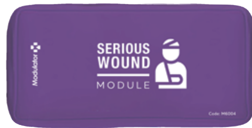
SERIOUS WOUND MODULE REFILL Code: M6004 Case Included