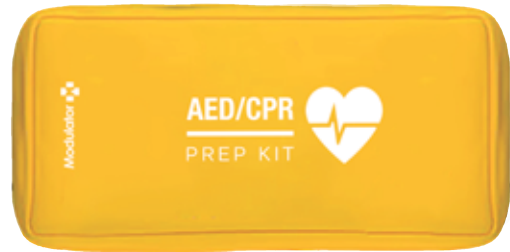
AED / CPR PREP MODULE Code: M6010 Case Included