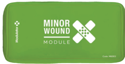
MINOR WOUND MODULE REFILL Code: M6003 Case Included