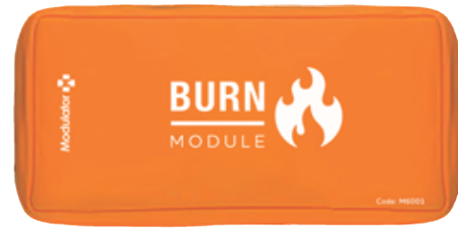
BURN MODULE REFILL Code: M6001 Case Included