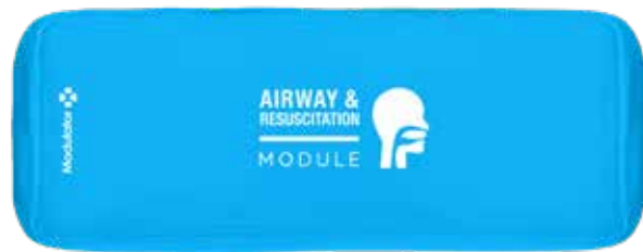
AIRWAY & RESUSCITATION MODULE Code: M6011 Case Included