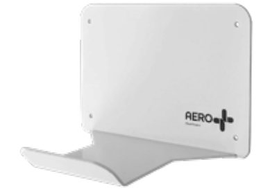
Item: Metal Wall Bracket Code: MWB01