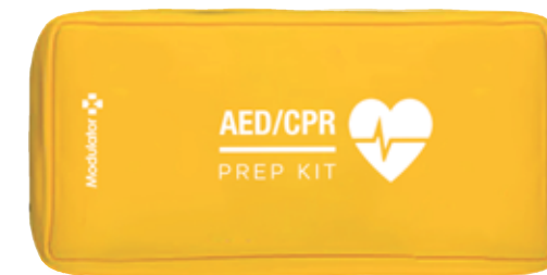
AED / CPR PREP MODULE Code: M6010 Case Included