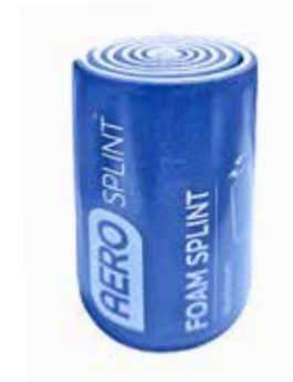
Item: Padded Splint Code: AR1060R Size: 24"L x 4.25"H