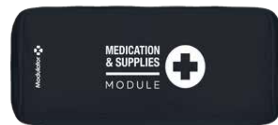
This empty black medical supplies bag is designed to fit securely inside the top compartment of the backpack and can be customized with your own medical tools and supplies. Item: Modulator Refill - Medication & Supplies (Empty / No Contents) Code: M6012