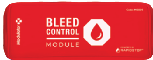
BLEED CONTROL MODULE REFILL* Code: M6005 Case Included