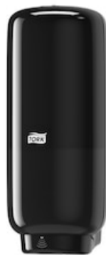
DISP S4 FOAM AUTOMATIC BLACK 4 /CS 571608