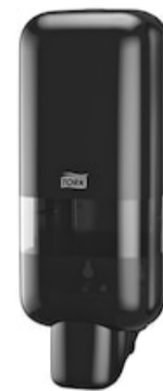
DISP SOAP MANUAL BLK (S4) 6 /CASE 581508