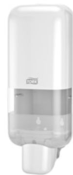
DISP SOAP MANUAL S4 WHITE (S4) 6 /CASE 581500