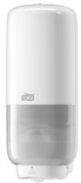
DISP S4 FOAM AUTOMATIC WHITE 4 /CS 571600