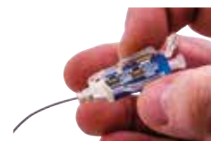
Insert and Click

Note: See color chart on page G2. For termination tools and accessories, see page G18. Cleave tool OFCLV3 suitable for multimode only. Visual Fault Locator OFVFLKT1 recommended during termination. Precision cleave tool OFCLV5 required for singlemode terminations. Use precision cleave tool for optimum performance.