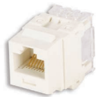
NK6X88MIW NK688MIW NKP5E88MIW