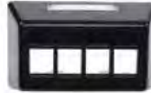
4-Port Inline FP4BBK