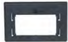
Adapter Plate HMRBBK