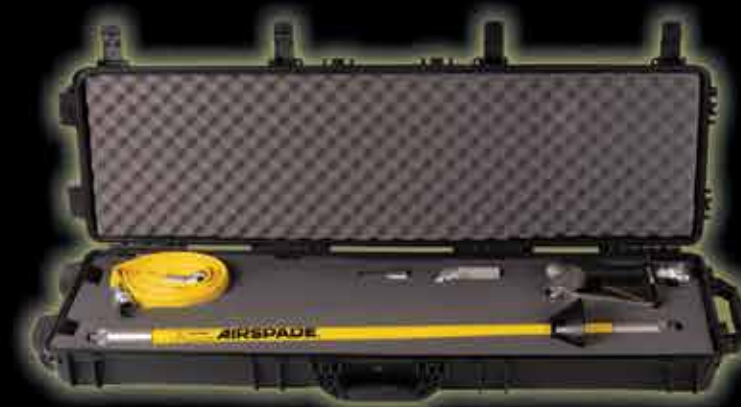
AirSpade 2000 Arbor/Landscape Kit shown above.

Air exiting from an improperly designed nozzle diffuses outward rapidly to 3 to 4 times the area versus the focused air-jet from the patented AirSpade supersonic nozzle. With AirSpade, the result is faster, safer, more efficient soil excavation.