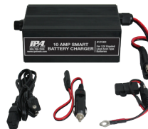
10-Amp Smart Battery Charger