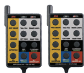
2x 12-Button Remote Controls