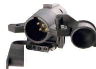
3-Way Trailer Adapter