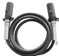
5' 7-Way Cable