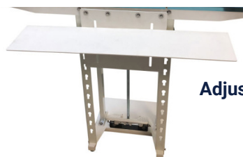
Adjustable Work Table