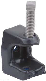
500-G Hanger Rod Beam Clamp

Corrosion-protected clamps for hanging threaded rod