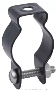
MINE3/4-G Mini Conduit Hanger

Includes stainless steel bolt and nut for fast, easy installation