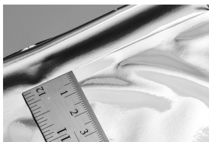
Seal Width 5mm (1/4")