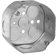
TP288, TP290, TP294